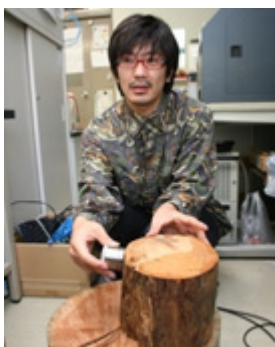
Measurement of ultrasound velocity